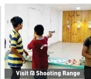
Visit to Shooting Range